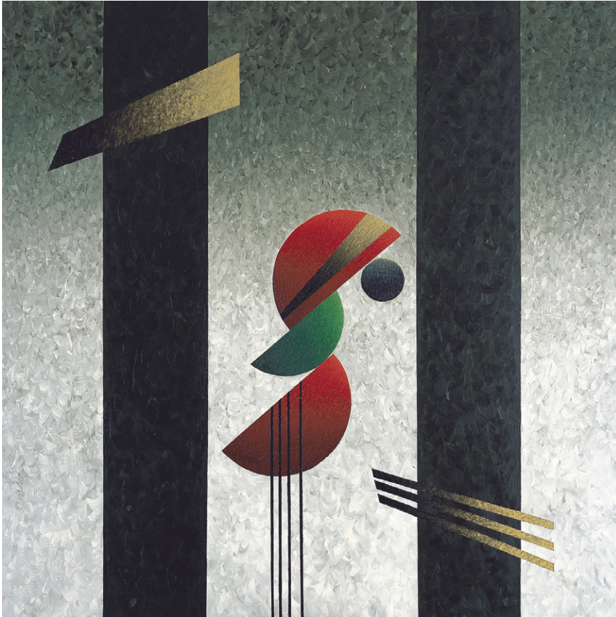
"Romeo and Juliet's Dance" (1994) oil on canvas, 60" x 60"