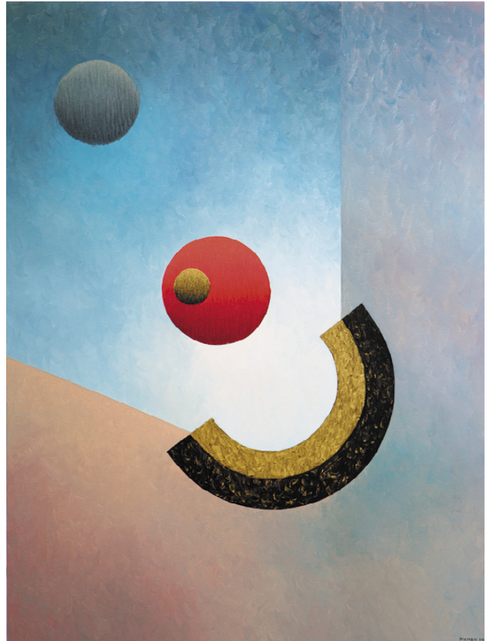
"Safe Landing" (2006) oil on canvas, 40" x 30"