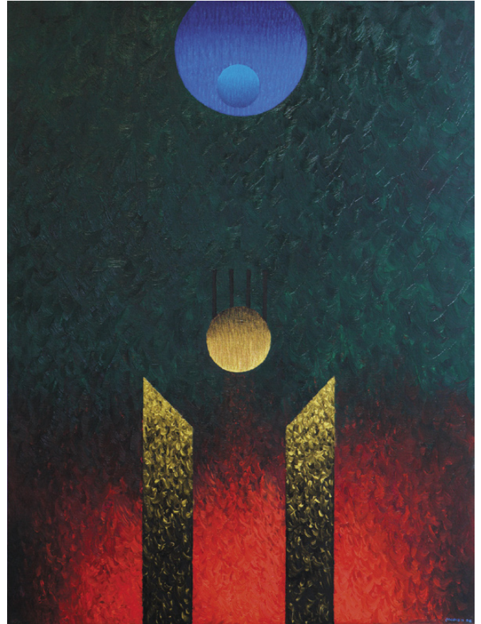
“Rising from the Temple” (2006) oil on canvas, 40” x 30”